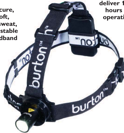
1.25 watt LED

Secure, soft, no sweat, adjustable headband